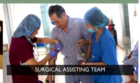
SURGICAL ASSISTING TEAM