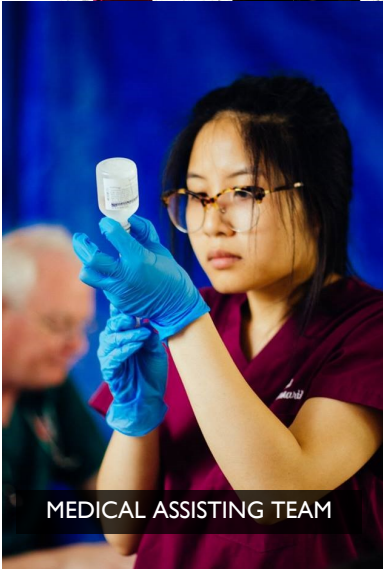
MEDICAL ASSISTING TEAM