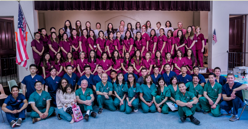
GSMDM APRIL CLINIC TEAM

Chick-Fil-A provided a free lunch for all the volunteers.